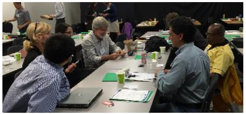
Figure 10. Breakout group discusses funding and finance recommendations.

There is early engagement of different financing groups and different types of finance mechanisms. It was recommended to hold а workshop to review financial tools, especially for early stages of assessment for storage developing countries. The point is to get on the path toward a CCS project. A developing country may not have the funding for the whole project, but the goal is to at least get started. Examples of such funding groups are the World Bank, etc.