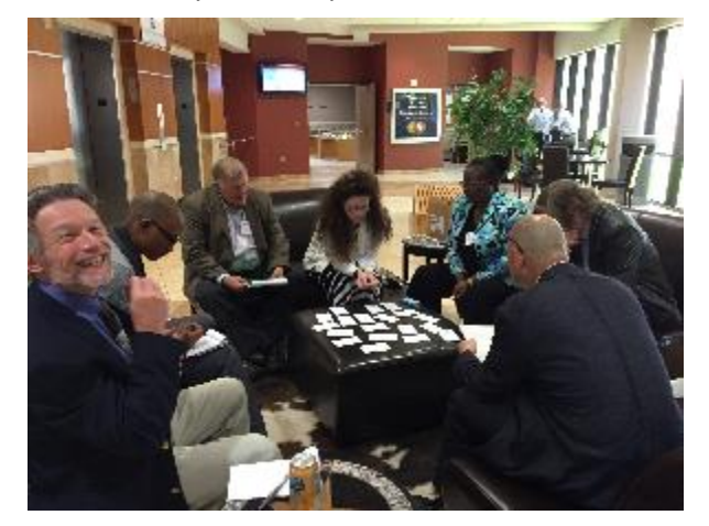
Figure 11. Breakout group discusses infrastructure recommendations.

2. It was also recommended to undertake an assessment the source side, for example with regard to intermittency and composition.