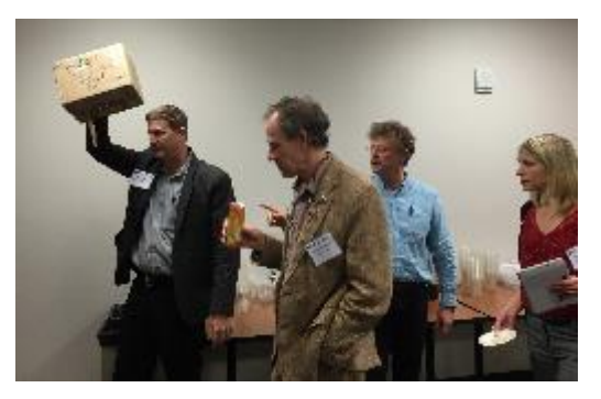
Figure 9. Boxes are labelled with discussion themes for breakout sessions.