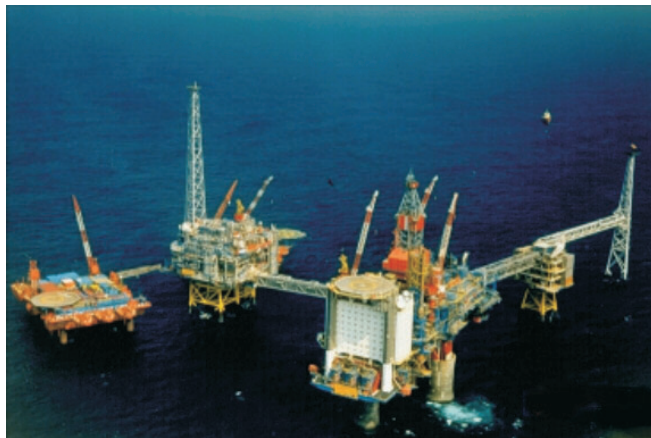
Sleipner West natural gas field where separated CO 2 is being injected into a deep salt-water reservoir

Treating CO 2 in this way, which almost entirely eliminates emissions to the atmosphere, marks a milestone in industrial history. This has never been done before on such a large scale. Nor has CO 2 been compressed and injected underground on an offshore platform before.